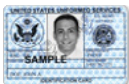
DD Form 2 (Retired)

100% Disabled Veterans Medal of Honor Recipients Some Retirees Eligible