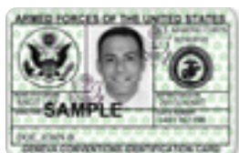
DD Form 2 (Reserve)