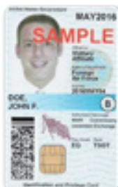
Common Access Card

Active Military Foreign Affiliate Eligible only with this ID (no other ID accepted)