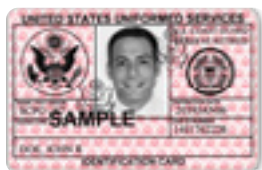
DD Form 2 (Reserve Retired)

Retired Reserves Retired National Guard Eligible