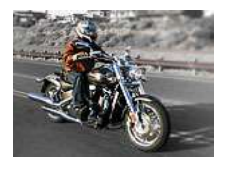
III Corps Policy Letter: GO-1 Covers Motorcycle Safety Requirements

Safety - 02 directs that a unit mentorship program is established at brigade or battalion level.