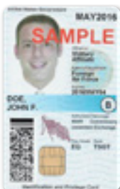
Common Access Card

Active Military Foreign Affiliate Eligible only with this ID (no other ID accepted)