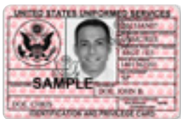
DD Form 1173-1

Retired Reserves Retired National Guard Eligible